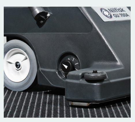
8 brush height positions for effective cleaning of all carpet types