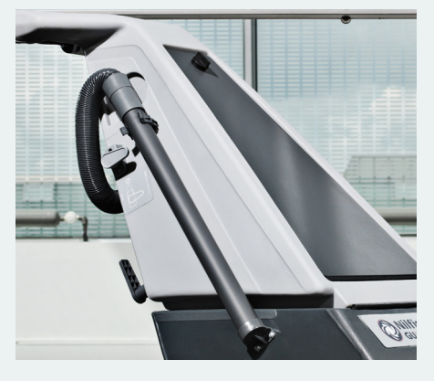
Simple controls and low profile design make operating the unit easier and safer